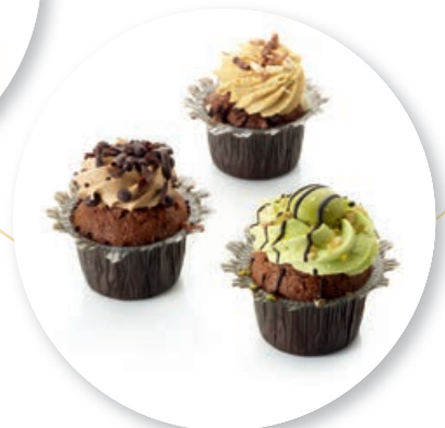
Cupcake Chocolate Collection ± 45 g per pc. / 12 pc. Ref. 03003 * -18°