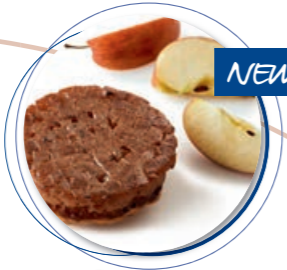
Tarte Tatin Apple & Lime ± 130 g per pc. / 10 Ø / 8 pc. Ref. 18011 * -18°