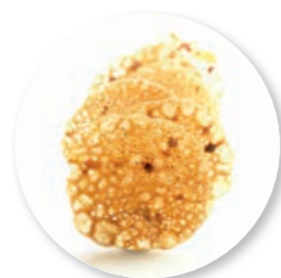
Dentelles Dessert 700 g / ± 180 pc. Ref. 1403