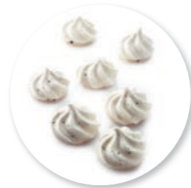
Meringue Choco Nips 250 g / Ref. 10240

Vanilla ice cream | Whipped cream | Meringue Mocha Hazelnut | Dentelles | Cocoa powder | Chopped Pistachios