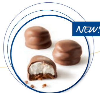
Mello Cakes Milk Chocolate 22 g per pc. / 20 pc. Ref. 1086 * -18°