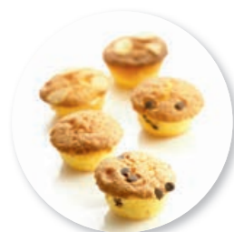
Assortment Mini Cakes 1300 g / ± 150 pc. Ref. 0221