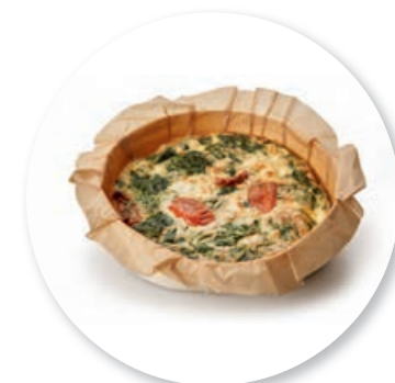
Quiche Mediterranean ± 440 g per pc. / 16 Ø / 6 pc. Ref.0033 * -18°