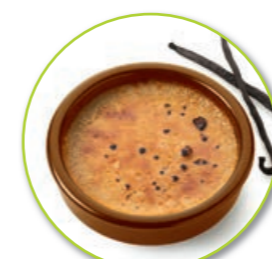
Crème Brûlée Vegan without added sugars 110 g per pc. / 4 pc. Ref. 1730 * -18°