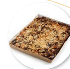
Almond Fruitcake Pear Chocolate 385 x 280 x 32 mm / 2300 g Ref. 0401 * -18°