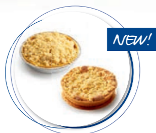
Bordalou Apple Crumble ± 110 g per pc. / 8 Ø / 10 pc. Ref. 05351 * -18°