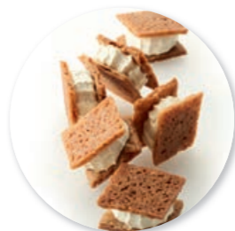
Tartine Russe 530 g Ref. 1077 * -18°