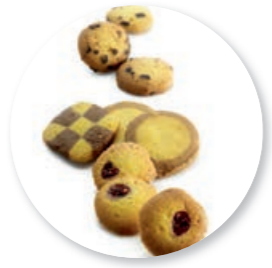
Assortment Butter Biscuits Extra Fine 600 g / ± 210 pc. Ref. 1045