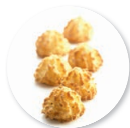
Rochers 1800 g / ± 135 pc. Ref. 07101