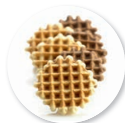
Assortment Butter Waffles 1200 g / ± 185 pc. Ref. 1011