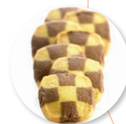
Domino 950 g / ± 135 pc. Ref. 06120