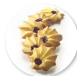
Sprits Raspberry 750 g / ± 120 pc. Ref. 0813