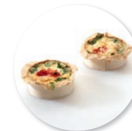
Mini Quiche Mediterranean ± 30 g per pc. / 5 Ø / 15 pc. Ref. 1100 * -18°