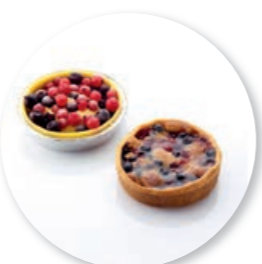
Bordalou Red Fruit ± 100 g per pc. 8 Ø / 10 pc. Ref. 05281 * -18°