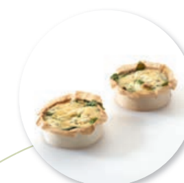
Mini Quiche Ricotta Spinach ± 30 g per pc. / 5 Ø / 15 pc. Ref. 1102 * -18°

The flavours Mediterranean, Ham Leeks Duvel and Ricotta Spinach are now also available in 5 cm diameter. These mini quiches are ideal for an aperitif.