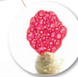
Dentelles Raspberry 500 g / ± 125 pc. Ref. 14071