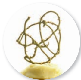
Rastoria Spinach 50 pc. Ref. 2203