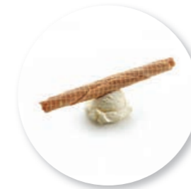
Retro Vanilla Roulette 430 g / ± 28 pc. Ref. 1082