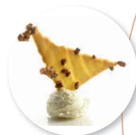
Trinité Lemon Chocoflakes 50 pc. Ref. 16191