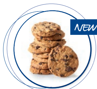
American Cookies 1350 g / ± 67 pc. Ref. 1083

These products are available in small buckets (S) .