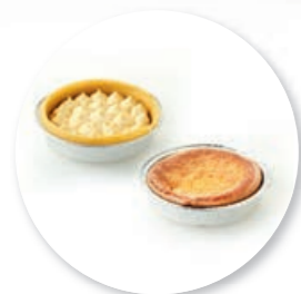
Bordalou Basic ± 60 g per pc. / 8 Ø / 10 pc. Ref. 05291 * -18°