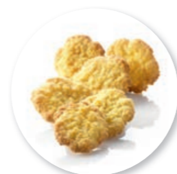
Crispy Coconut 650 g / ± 95 pc. Ref. 0700