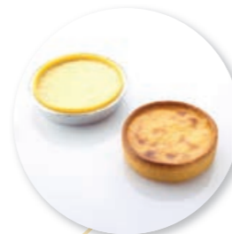
Bordalou Rice ± 80 g per pc. 8 Ø / 10 pc. Ref. 0520 * -18°