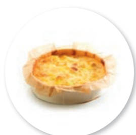
Quiche Ham Leek Duvel ± 140 g per pc. / 10 Ø / 8 pc. Ref. 0200 * -18°