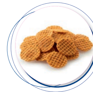
Mini Gaufrettes Tomato Basil 450 g / ± 360 pc. Ref. 2250