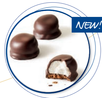
Mello Cakes Dark Chocolate 22 g per pc. / 20 pc. Ref. 1087 * -18°

Completely new in our range are the traditional Mello cakes created by Stephan Destrooper. A crunchy butter biscuit with a praline filling, topped with Italian meringue and finished off with a perfect layer of chocolate. Which flavour do you choose: dark, milk or white chocolate?