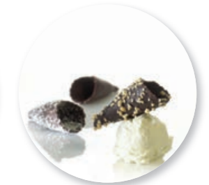
Assortment Petit Cornet 45 pc. Ref. 2402