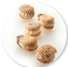
Biscuit Vanilla 530 g Ref. 1076 * -18°