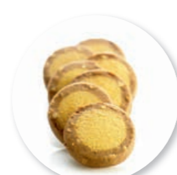
Sablé Mocha Hazelnut 950 g / ± 125 pc. Ref. 0631