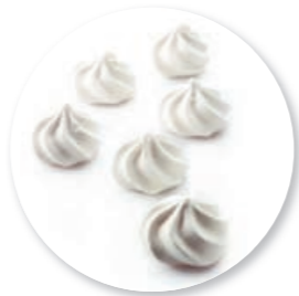
Meringue Traditionnel 250 g / Ref. 10242