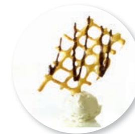
Vanilla Chocolate Grid 6 pc. Ref. 1616