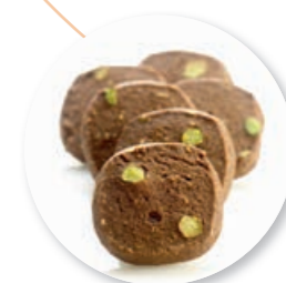
Cracao 950 g / ± 125 pc. Ref. 06050