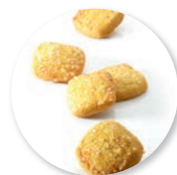
Pavé Sucré 800 g / ± 100 pc. Ref. 1055