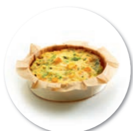
Quiche Pumpkin Goat's Cheese Bacon ± 140 g per pc. / 10 Ø / 8 pc. Ref. 0217 * -18°