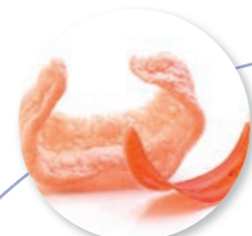
Cracker Red Curry 48 pc. Ref. 1503