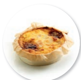
Quiche Bleu d'Auvergne Pear Almond ± 140 g per pc. / 10 Ø / 8 pc. Ref. 0216 * -18°