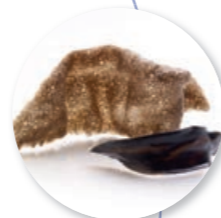
Cracker Sepia 48 pc. Ref. 1505