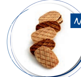
Retro Crispy Butter Wafers 800 g / ± 78 pc. Ref. 1022