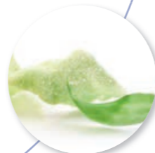
Cracker Wasabi 48 pc. Ref. 1501

Serving tip Cracker Smoked Pepper | Goat's cheese from Polle | Granny Smith Granité | Lemon gel | Vegetable Sheet Potato