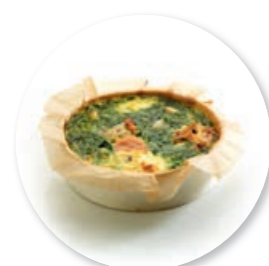
Quiche Mediterranean ± 140 g per pc. / 10 Ø / 8 pc. Ref. 0201 * -18°

Our artisanal and rich filled belgian quiches are also available in portions of 440g.