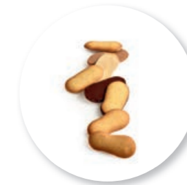
Retro Cat's Tongue Cookies 640 g / ± 80 pc. Ref. 0821