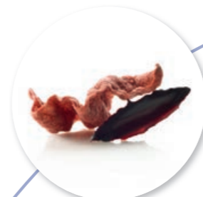
Cracker Chocolate 48 pc. Ref. 1510

Serving tip Cracker chocolate | Chocolate Moelleux | Vanilla Ice Cream | Papaya Gel