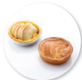
Bordalou Apple ± 110 g per pc. 8 Ø / 10 pc. Ref. 05221 * -18°