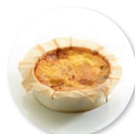
Quiche Brie Bacon Breydel ± 140 g per pc. / 10 Ø / 8 pc. Ref. 02131 * -18°