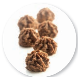
Rochers Chocolate 1800 g / ± 115 pc. Ref. 07132