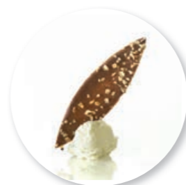
Pétale Chocolate Noisette 80 pc. Ref. 1618