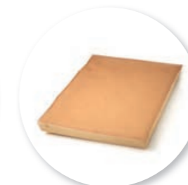
Biscuit Chocolate 385 x 280 x 32 mm / 700 g Ref. 0000 * -18°