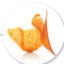
Cracker Smoked Pepper 48 pc. Ref. 1508