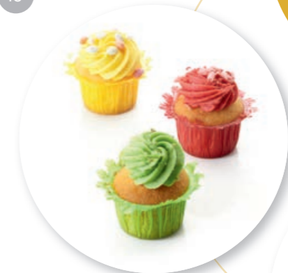
Cupcake Fruit Collection ± 45 g per pc. / 12 pc. Ref. 03000 * -18°

Due to the short thawing time the cupcakes are quick and easy to use.