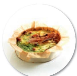
Quiche Salmon Ricotta ± 140 g per pc. / 10 Ø / 8 pc. Ref. 0210 * -18°