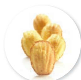
Mini Madeleines 1200 g / ± 120 pc. Ref. 0252