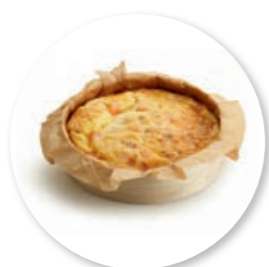
Quiche Tomato Mozzarella ± 140 g per pc. / 10 Ø / 8 pc. Ref. 0220 * -18°