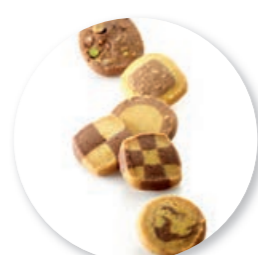
Assortment Mocques 1500 g / ± 195 pc. Ref. 0602