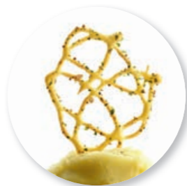
Rastoria Seaweed 50 pc. Ref. 2208