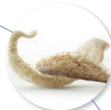
Cracker Truffle 48 pc. Ref. 1506