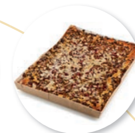
Almond Fruitcake Rhubarb 385 x 280 x 32 mm / 2300 g Ref. 0403 * -18°