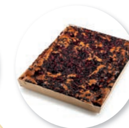
Almond Fruitcake Red Fruits 385 x 280 x 32 mm / 2300 g Ref. 0404 * -18°