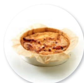
Quiche Goat's Cheese Honey Hazelnut ± 140 g per pc. / 10 Ø / 8 pc. Ref. 0215 * -18°