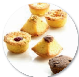
Assortment Friands 750 g Ref. 1207 * -18°