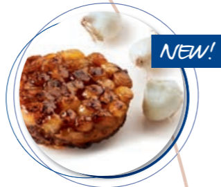
Tarte Tatin Pearl onions & Thyme ± 130 g per pc. / 10 Ø / 8 pc. Ref. 18031 * -18°