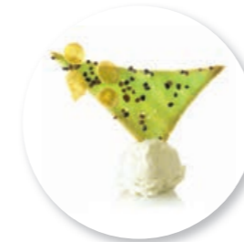
Trinité Pistachio Cornflakes 50 pc. Ref. 1619

Vanilla Ice Cream | Vanilla Noisette | Meringue Traditionnel | Raspberries | Strawberries | Blueberries