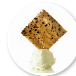
Carré Cappuccino 80 pc. Ref. 16001