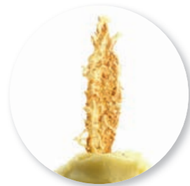
Parmesan Decor 50 pc. Ref. 2201