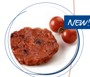
Tarte Tatin Cherry Tomatoes ± 130 g per pc. / 10 Ø / 8 pc. Ref. 18041 * -18°

Serving Tip Tatin pearl onions & thyme | Natural Sauce Salsa Brava | Natural Sauce Aji Amarillo | Burger | Vene cress