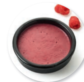
Crème Brûlée Raspberry with 100% pure fruit 110 g per pc. / 4 pc. Ref. 1712 * -18°