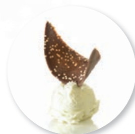
Chocolate Crispy 40 pc. Ref. 1601