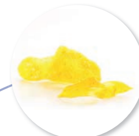
Cracker Saffron 48 pc. Ref. 1502