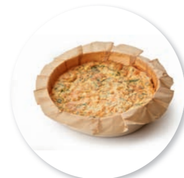
Quiche Lorraine ± 440 g per pc. / 16 Ø / 6 pc. Ref.0035 * -18°