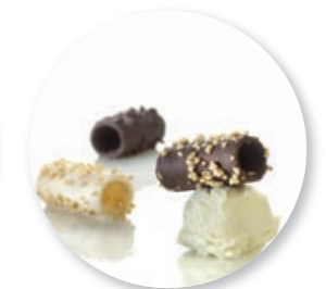
Assortment Cannelloni 54 pc. Ref. 2400