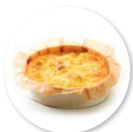
Quiche Lorraine ± 140 g per pc. / 10 Ø / 8 pc. Ref. 0219 * -18°