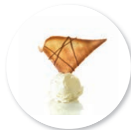
Tulipe Fantasy 40 pc. Ref. 1608