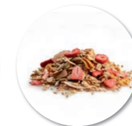
Granola # 8 Strawberry Mango 900g - Ref. 0053