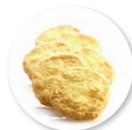
Pain Turc 800 g / ± 115 pc. Ref. 0647