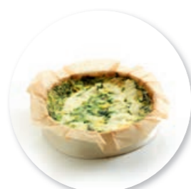
Quiche Ricotta Spinach ± 140 g per pc. / 10 Ø / 8 pc. Ref. 0204 * -18°