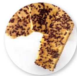
Biscuits to break Chocolate ± 990 g / 5 pc. Ref. 1063