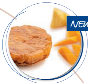
Tarte Tatin Exotic ± 130 g per pc. / 10 Ø / 8 pc. Ref. 18021 * -18°