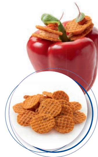
Mini Gaufrettes Chorizo Mozzarella 450 g / ± 440 pc. Ref. 2251

Unique, light and tasty mini gaufrettes. Serve with an aperitif or when tasting specialty beers and cheeses. Chefs can also use the mini gaufrettes creatively in their dishes.