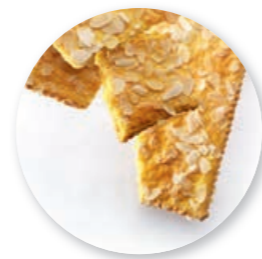
Biscuits to break Almond ± 1000 g / 5 pc. Ref. 1062

These products are available in a black box .