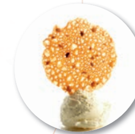
Dentelles Dessert 500 g / ± 140 pc. Ref. 14021