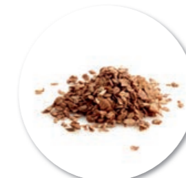
Granola # 3 Cocoa 900 g - Ref. 0052