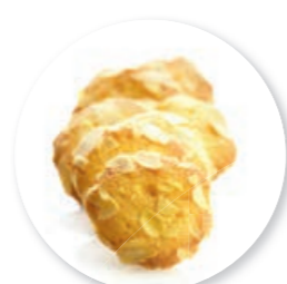
Amandines 950 g / ± 250 pc. Ref. 0206