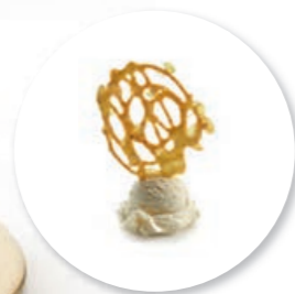
Rastoria Almond 50 pc. Ref. 1637