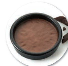
Crème Brûlée Chocolate Callebaut chocolate 110 g per pc. / 4 pc. Ref. 1717 * -18°