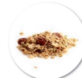
Granola # 5 Pecan Almond 900 g - Ref. 0051