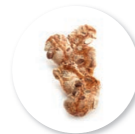
Retro Crocq' Almond 250 g / ± 50 pc. Ref. 1081