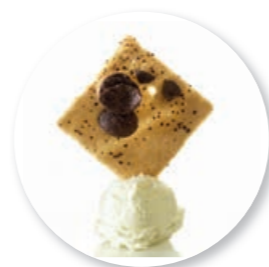
Carré Mocha Chocoflakes 50 pc. Ref. 16002