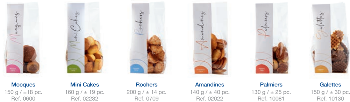
Mocques 150 g / ±18 pc. Ref. 0600 Mini Cakes 160 g / ± 19 pc. Ref. 02232 Rochers 200 g / ± 14 pc. Ref. 0709 Amandines 140 g / ± 40 pc. Ref. 02022 Palmiers 130 g / ± 25 pc. Ref. 10081 Galettes 150 g / ± 30 pc. Ref. 10130

For over 25 years we have been making cookies and cakes according to the Belgian tradition with high-quality ingredients and a delicious traditional taste. Now also available with a colourful cardboard sleeve .