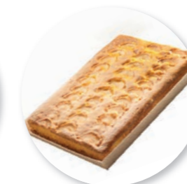
Apple Cake 385 x 280 x 32 mm / 2500 g Ref. 0422 * 0-7°