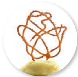
Rastoria Tomato 50 pc. Ref. 2204