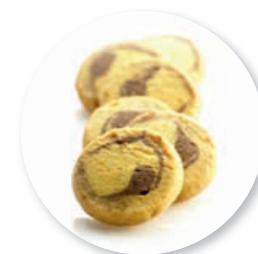
Marbré 950 g / ± 125 pc. Ref. 06160