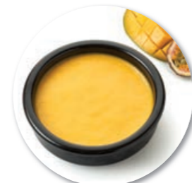
Crème Brûlée Mango Passion with 100% pure fruit 110 g per pc. / 4 pc. Ref. 1713 * -18°