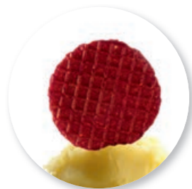
Gaufrette Beetroot 180 pc. Ref. 2211