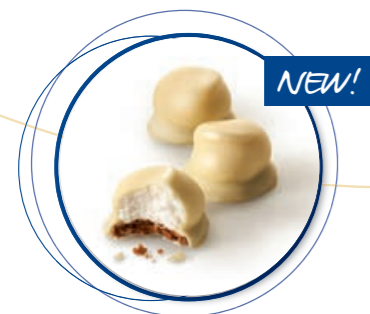
Mello Cakes White Chocolate 22 g per pc. / 20 pc. Ref. 1085 * -18°

Deluxe biscuits and cakes by Didess are exquisitely made using the finest ingredients. They are a delectable treat for festive occasions or as part of your high tea.