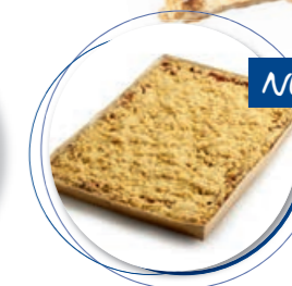
Almond Fruitcake Apple Crumble 385 x 280 x 32 mm / 2300 g Ref. 0405 * -18°