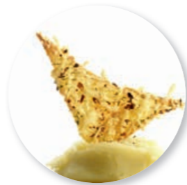
Mai Phai 50 pc. Ref. 2200