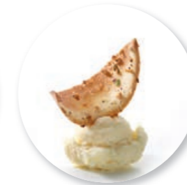
Vanilla Noisette 40 pc. Ref. 1610