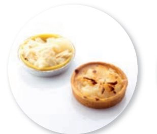
Bordalou Pear ± 110 g per pc. 8 Ø / 10 pc. Ref. 05251 * -18°