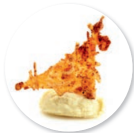
Waco Taco 50 pc. Ref. 2213