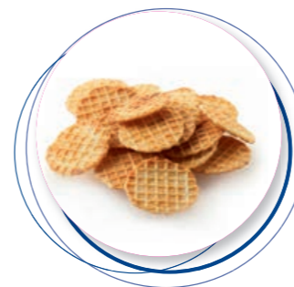
Mini Gaufrettes Maroilles Cheese 450 g / ± 360 pc. Ref. 2252