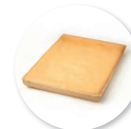
Biscuit Nature 385 x 280 x 32 mm / 700 g Ref. 0001 * -18°