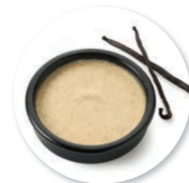
Crème Brûlée Vanilla Madagascar 110 g per pc. / 4 pc. Ref. 1710 * -18°