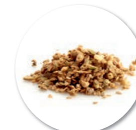
Granola # 7 Cashew Banana 900 g - Ref. 0050