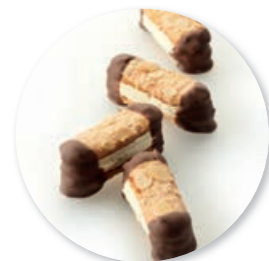
Biscuit Almond Meringue 550 g Ref. 1075 * -18°

These products are available in a black box.