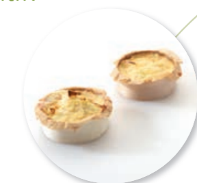
Mini Quiche Ham Leek Duvel ± 30 g per pc. / 5 Ø / 15 pc. Ref. 1101 * -18°