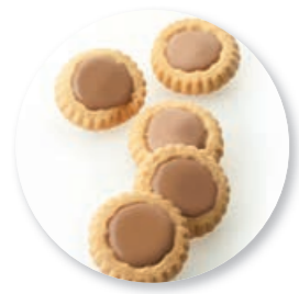
Délice Milk Chocolate 800 g / ± 100 pc. Ref. 1071

The gastronomic biscuits by Didess are a bit smaller and more elegant, perfect for a luxury presentation. Serve the gastronomic biscuits after dinner together with Belgian pralines and coffee or tea.