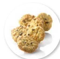
Crocros Chocolate 650 g / ± 95 pc. Ref. 0721