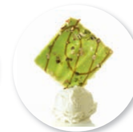
Carré Pistachio 80 pc. Ref. 1600