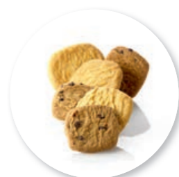
Assortment Crunchy Butter Biscuits 1100 g / ± 145 pc. Ref. 1046