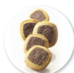
Sablé Chocolate 950 g / ± 105 pc. Ref. 0632