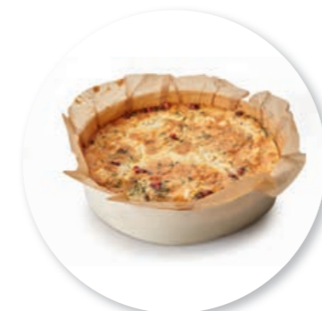
Quiche Salmon Ricotta ± 440 g per pc. / 16 Ø / 6 pc. Ref.0034 * -18°