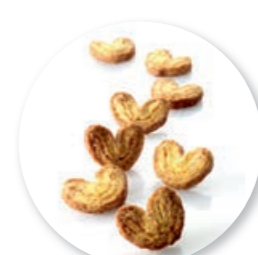
Palmiers 700 g / ± 142 pc. Ref. 1008