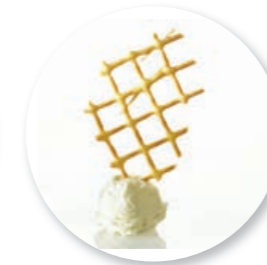
Vanilla Grid 6 pc. Ref. 1615