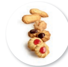
Retro Sprits 600 g / ± 80 pc. Ref. 0820

The retro biscuits are tasteful and old-fashioned biscuits, which fit perfectly into the current retro & vintage style.