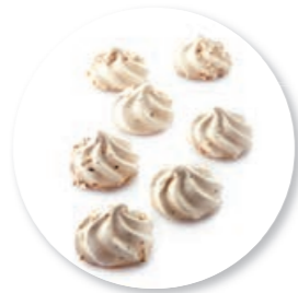
Meringue Mocha Hazelnut 250 g / Ref. 10241